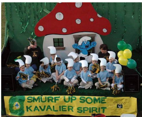
The Class of 2023 "Smurfed" up an original float.

Kenston Forest students celebrated Homecoming the week of Oct 3rd-8th. Monday through Thursday, the Upper School had different themes, including Sharpie/Pajama Day, Girls' Hush button/Team Day, Boys' Hush button/Multiplicity Day, and Salad Dressing/Blast from the Past Day. Lower School students had their own daily themes, including Pajama Day, Mix-Match Day, Crazy Hat/Shades Day, and Crayola Day. The bonfire was held Thursday evening in conjunction with Fields of Faith. Friday was Spirit Day. Students in grades 5-12 went to the football field after lunch to enjoy fun-filled activities. The powder-puff game was a featured event with the girls playing football and the boys cheerleading.